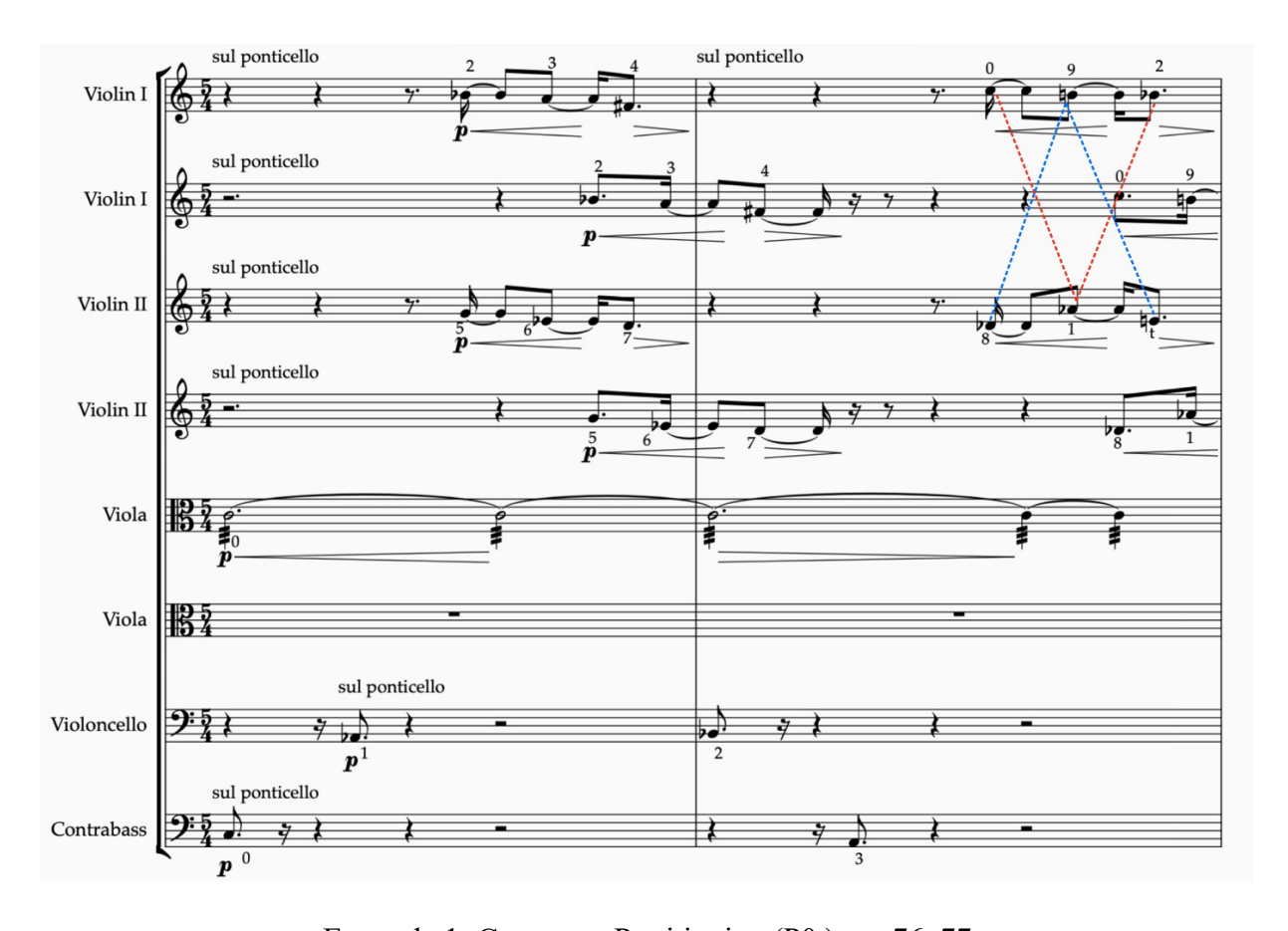
Example 1: Crossover Partitioning (P0), m. 76–77