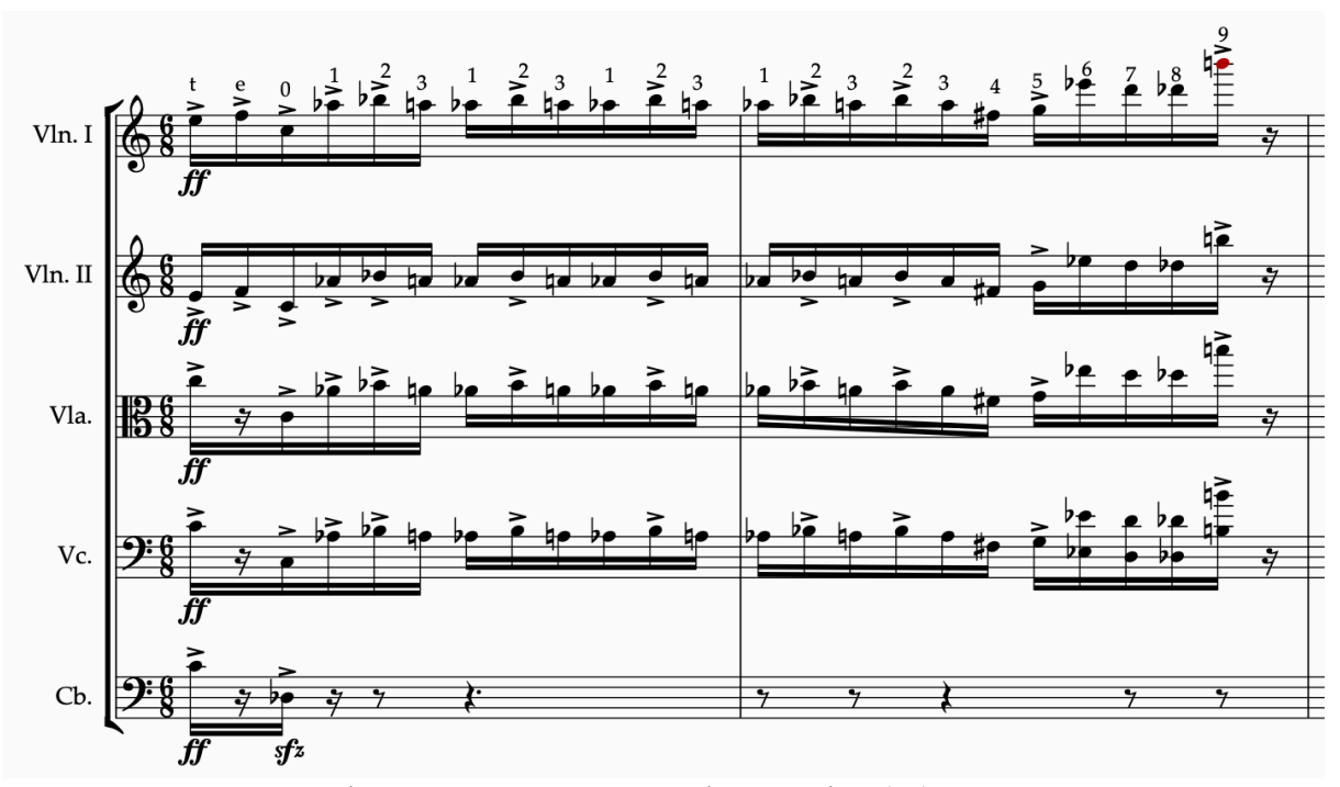
Example 3: Fragmentary Internal Expansion (P<sub>0</sub>), mm. 177–78